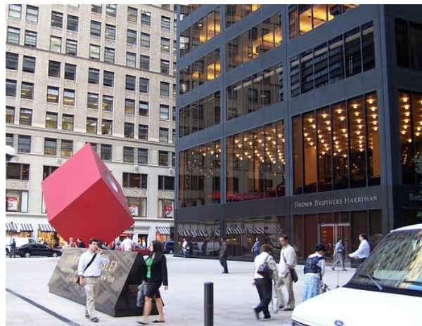
Brown Brothers Harriman (BBH) New

The Lord Mayor and 12 member council serve as proxies/representatives who sit-in for 13 of the world's wealthiest, most powerful banking families (syndicates) headed by Rothschild Dynasty they include; Warburgs, Oppenheimers, Schiffs – these families and their descendants run the Crown Corporation of London – Rockefeller Syndicate runs American colony through interlocking directorships in JP Morgan Chase/Bank of America and Brown Brothers Harriman (BBH)