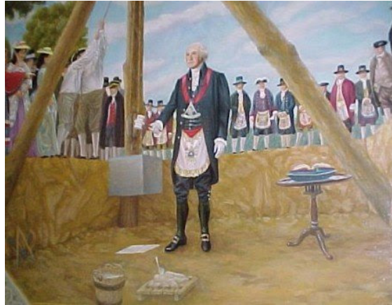
The laying of the U.S. Capitol cornerstone by Washington in full Masonic attire

The U.S.A. is a Crown Colony — careful study of signed treaties/charters between Britain and U.S. exposes a well-kept secret – U.S. has always been and remains a British Crown colony. King James I not just famous for translating the Bible into “The King James Version”, but for signing first charter of Virginia in 1606 — which granted America’s British forefathers license to settle and colonize America — also guaranteed future Kings/Queens of England would have sovereign authority over all citizens and colonized land in America, stolen from Native Americans via genocidal methods — its farming industry/infrastructure was developed by Africans “stolen” from their homeland, classified as property and relegated to sub-human status.