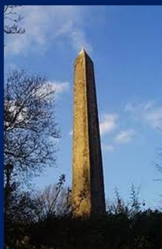
The City, London

— John F Kennedy, 35th President of the United States, from a speech delivered to the American Newspaper Publishers Association on April 27, 1961 and known as the “Secret Society” speech (click here for full transcript and audio).